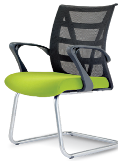
E 2673S - Visitor