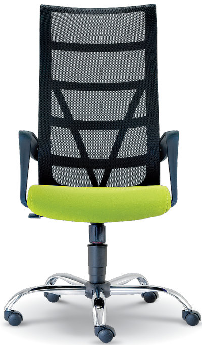
E 2671H - High Back