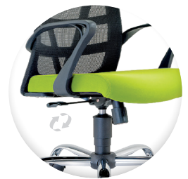
"1" POSITION LOCKING SYSTEM