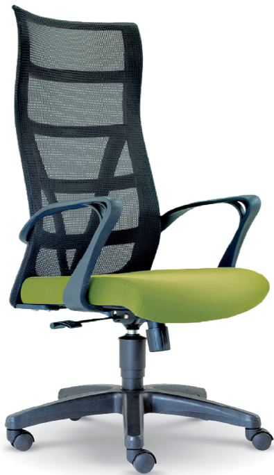
E 2675H - High Back