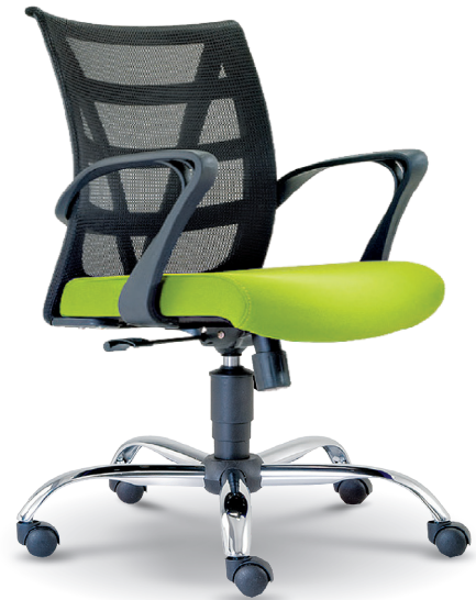
E 2672H - Low Back