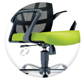
"1" POSITION LOCKING SYSTEM