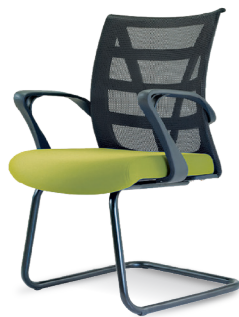
E 2677S - Visitor