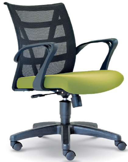
E 2676H - Low Back