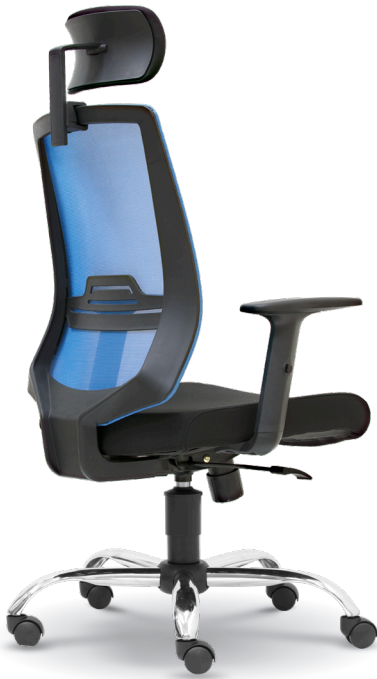
E 2751H - High Back