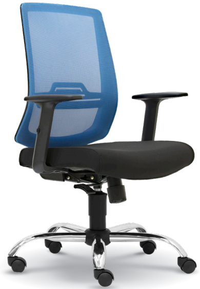
E 2752H - Medium Back