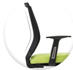
CURVED BACKREST DESIGN