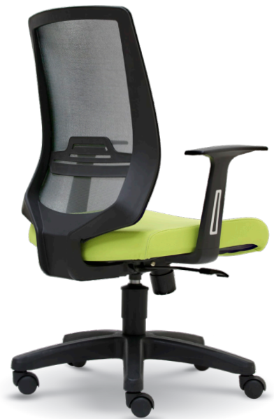
E 2756H - Medium Back