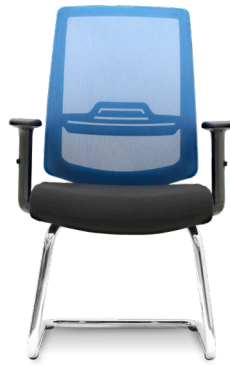
E 2753S - Visitor