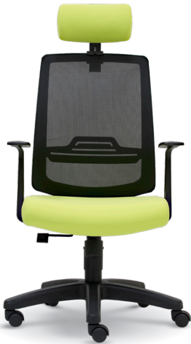
E 2755H - High Back