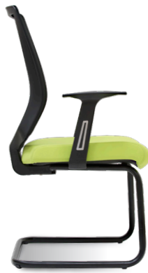
E 2757S - Visitor