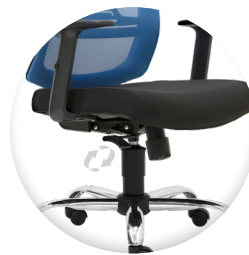
"1" POSITION LOCKING SYSTEM