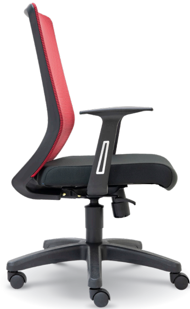
E 3026H - Medium Back