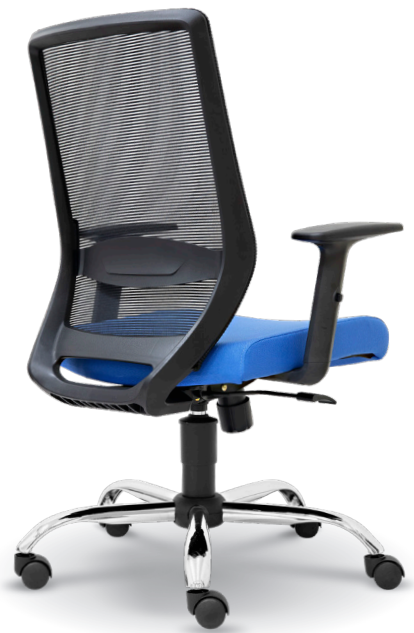
E 3022H - Medium Back