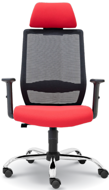
E 3021H - High Back