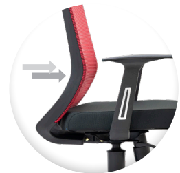
LUMBAR SUPPORT BACKREST