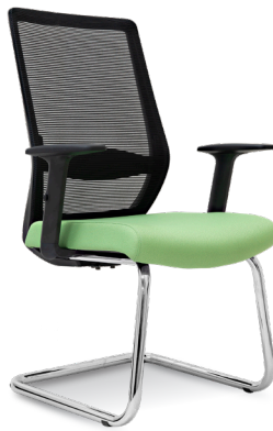
E 3023S - Visitor