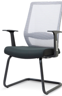
E 3027S - Visitor