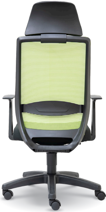
E 3025H - High Back