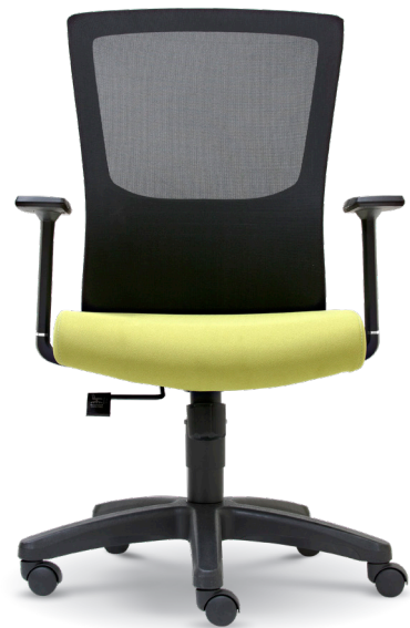
E 2686H - Medium Back