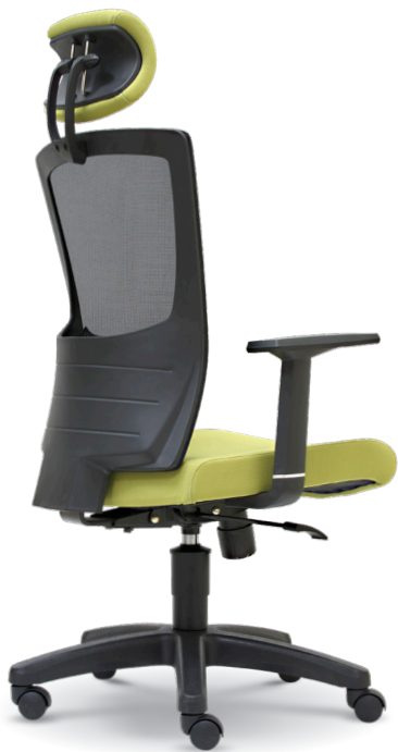
E 2685H - High Back