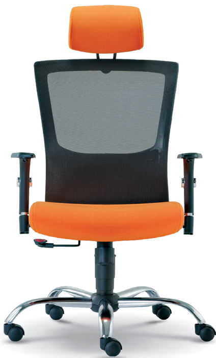
E 2681H - High Back