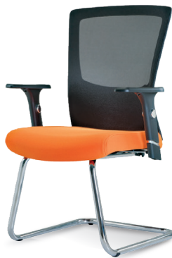
E 2683S - Visitor