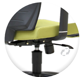
"1" POSITION LOCKING SYSTEM