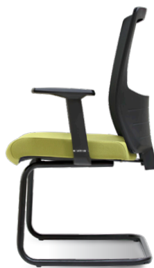
E 2687S - Visitor