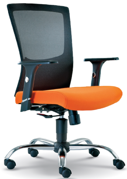
E 2682H - Medium Back