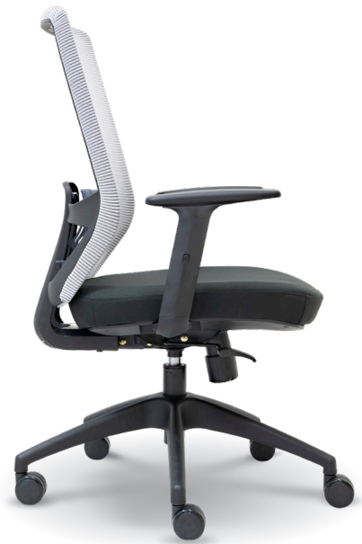
E 3016H - Medium Back