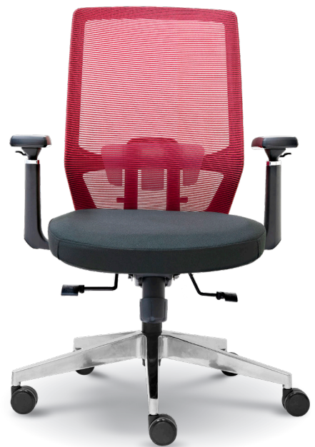
E 3012H - Medium Back