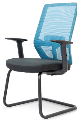
E 3017S - Visitor