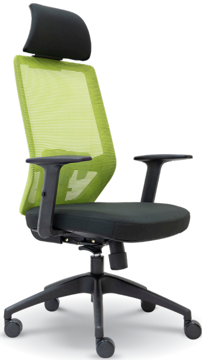
E 3015H - High Back