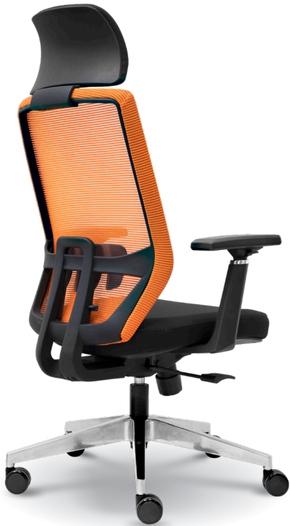
E 3011H - High Back