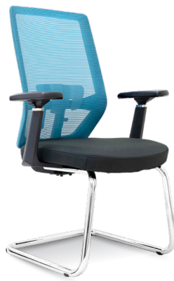
E 3013S - Visitor