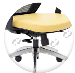
"3" POSITION LOCKING SYSTEM