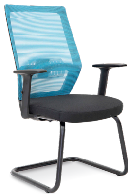
E 2937S - Visitor