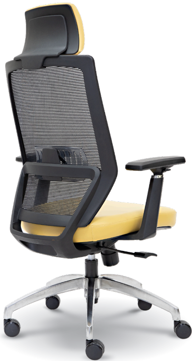
E 2931H - High Back