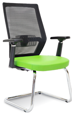
E 2933S - Visitor