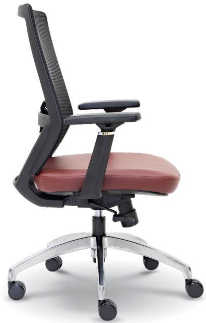
E 2932H - Medium Back