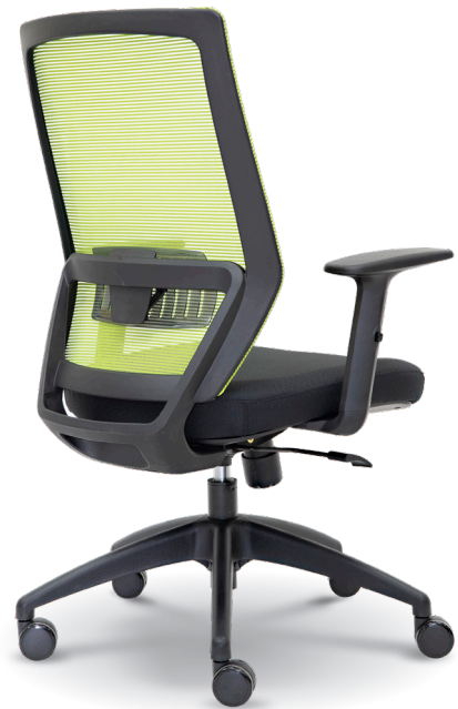
E 2936H - Medium Back