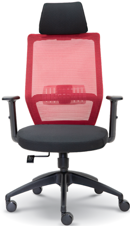
E 2935H - High Back