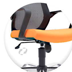
"1" POSITION LOCKING SYSTEM