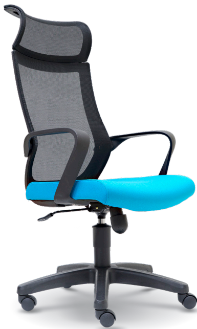
E 2825H - High Back