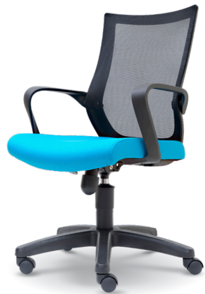
E 2826H - Medium Back