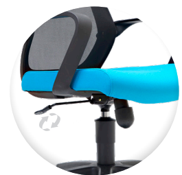
"1" POSITION LOCKING SYSTEM