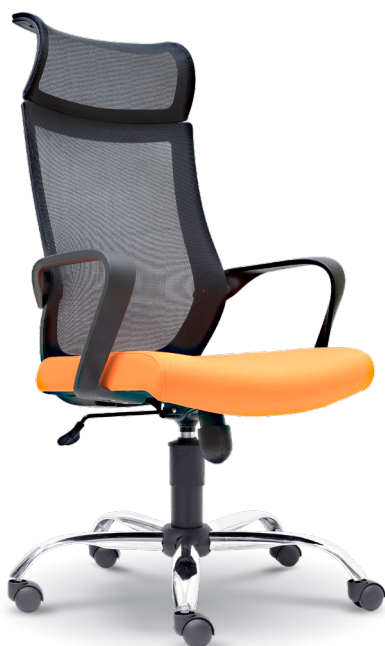
E 2821H - High Back