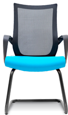
E 2827S - Visitor