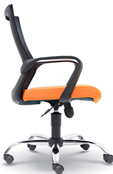
E 2822H - Medium Back