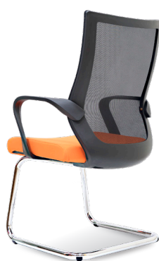
E 2823S - Visitor