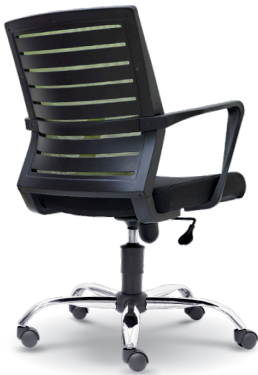
E 2735H - Low Back