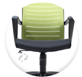
"TILT" RECLINING MECHANISM