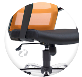
"TILT" RECLINING MECHANISM