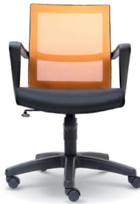
E 2732H - Low Back