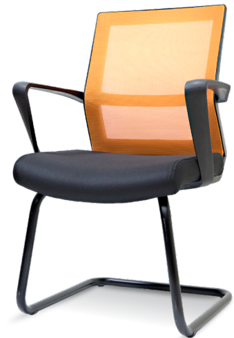
E 2733S - Visitor