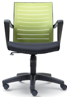
E 2736H - Low Back