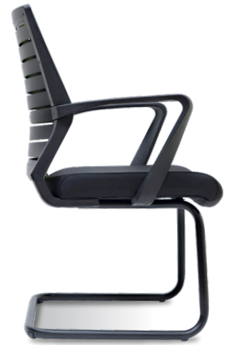
E 2737S - Visitor