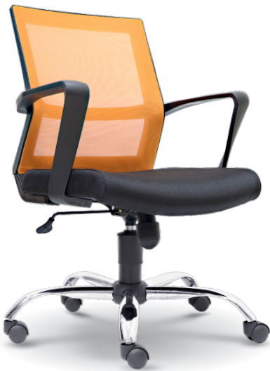
E 2731H - Low Back