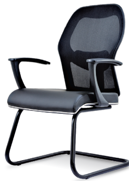
E 2097S - Visitor