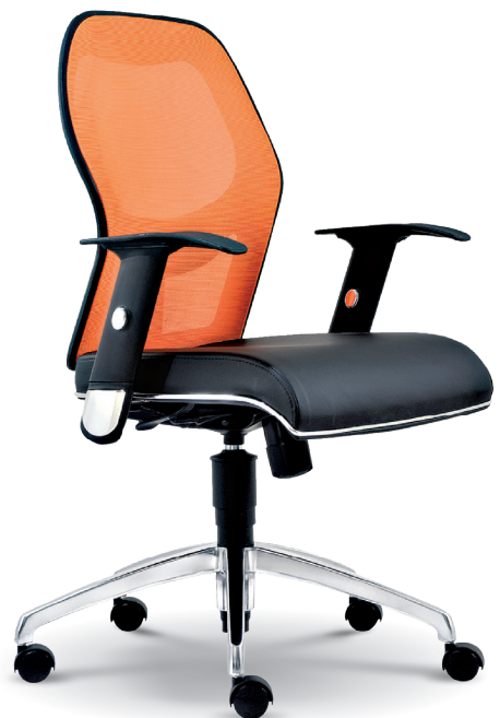
E 2092H - Medium Back