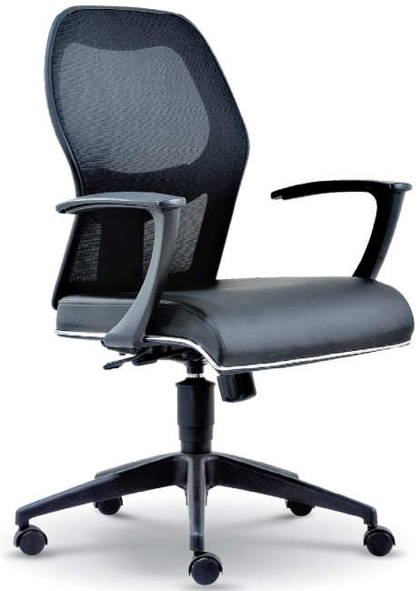
E 2096H - Medium Back