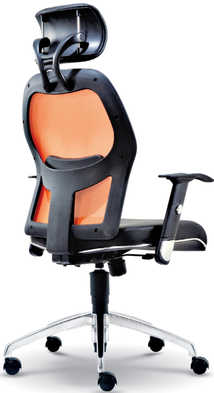
E 2091H - High Back