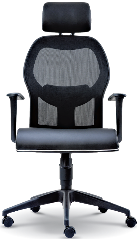
E 2095H - High Back