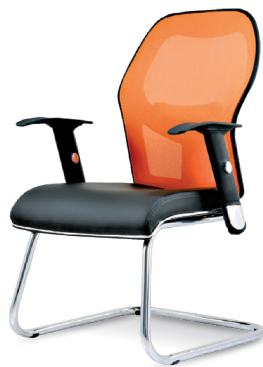
E 2093S - Visitor