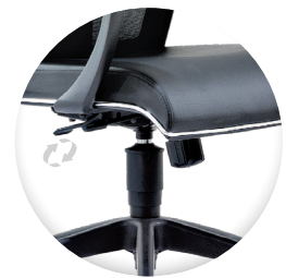
"1" POSITION LOCKING SYSTEM