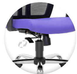
"1" POSITION LOCKING SYSTEM