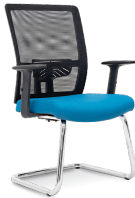
E 2953S - Visitor