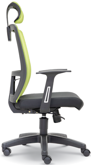
E 2955H - High Back