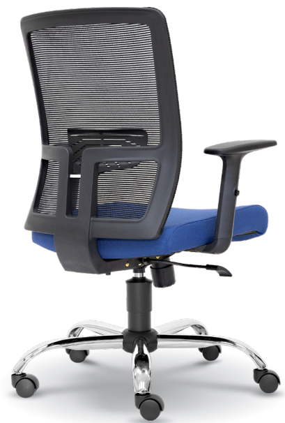
E 2952H - Medium Back