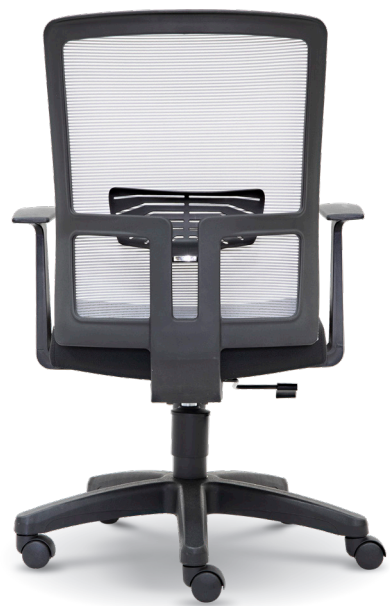
E 2956H - Medium Back