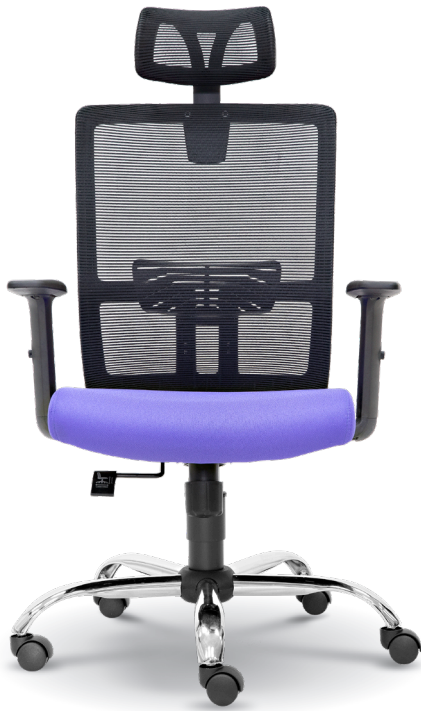
E 2951H - High Back