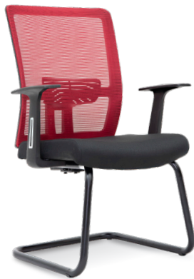
E 2957S - Visitor